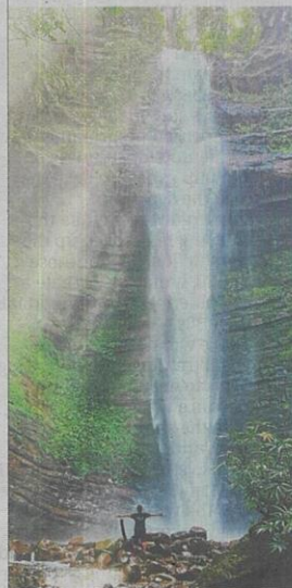
U'ong Bilong or the Bird's Nest waterfall at Ulu Baram.