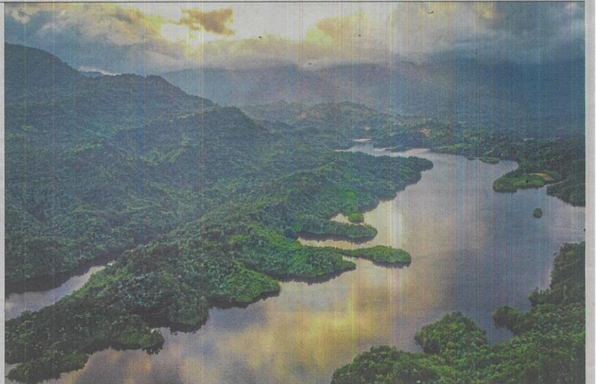
Set for discovery: With over 47 national parks, nature is not a backdrop, but an experience in Sarawak.

The Gateway to Sarawak project has even earned a Guinness World Record for the Longest GPS Journey by Drone Relay, which will be showcased during the state's "Countdown 2026" celebration at the Kuching Waterfront on Dec 31. Here is a sneak preview.