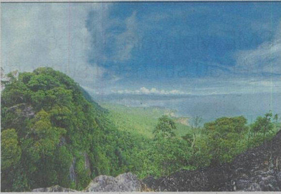
From Bako to the emerging Sarawak Delta, each encounter deepens understanding of the land and its people.