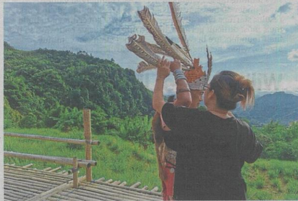
(Left) Getting ready to share. Visitors can join in the land's ancestral traditions and indigenous wisdom through longhouse hospitality, crafts, music and dances.