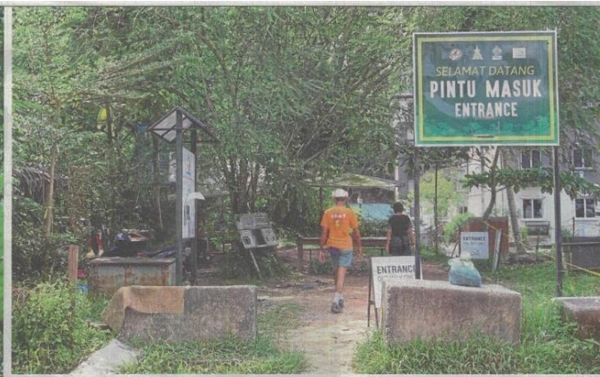
The entrance to Bukit Wawasan in Puchong.