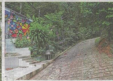
(Left) Hiking trail at Bukit Dinding.