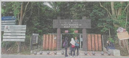
Visitors at the entrance to Bukit Gasing in Petaling Jaya, Selangor.