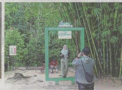
(Above) Photo booth at Kota Damansara Community Forest Reserve.