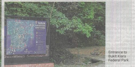
Entrance to Bukit Kiara Federal Park.