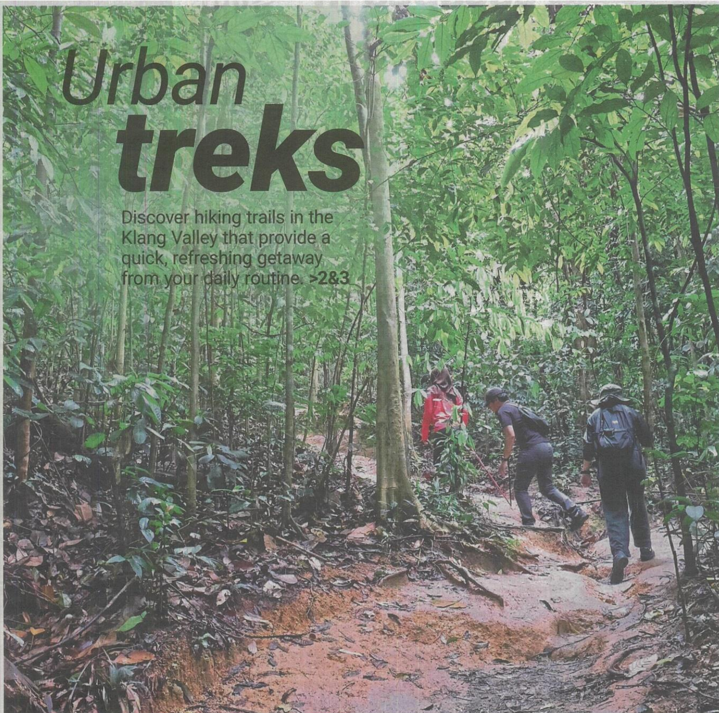
Adventure time: Hikers making their way along a well-trodden path through Kota Damansara Community Forest Reserve in Petaling Jaya, Selangor.

Discover hiking trails in the Klang Valley that provide a quick, refreshing getaway from your daily routine. >2&3