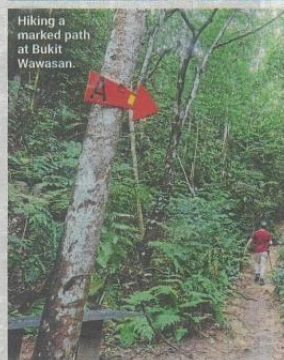
Hiking a marked path at Bukit Wawasan.

with leafy paths and just enough elevation to feel satisfying. If you're the type who wants to go on a casual hike, this hill with one of its trailheads in Damansara Perdana is ideal. Just note that there's limited information online, so it's best to go with someone familiar with the area.