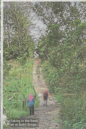
Taking in the fresh air at Bukit Broga.