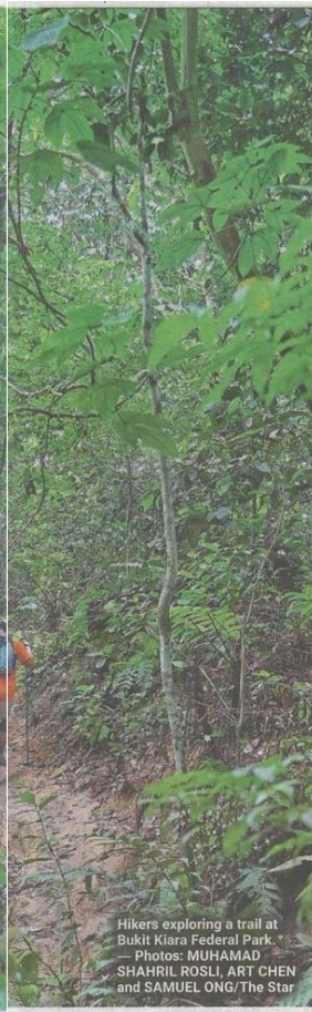
Hikers exploring a trail at Bukit Kiara Federal Park.

6. Bukit Wawasan Opening hours: 24 hours Highlight: Sweet challenge for beginners In the heart of Puchong, Selangor,